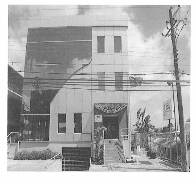
GHRS Headquarters now located at 16 Mulchan Seuchan Road, Chaguanas

There are no reports to be published under this section.